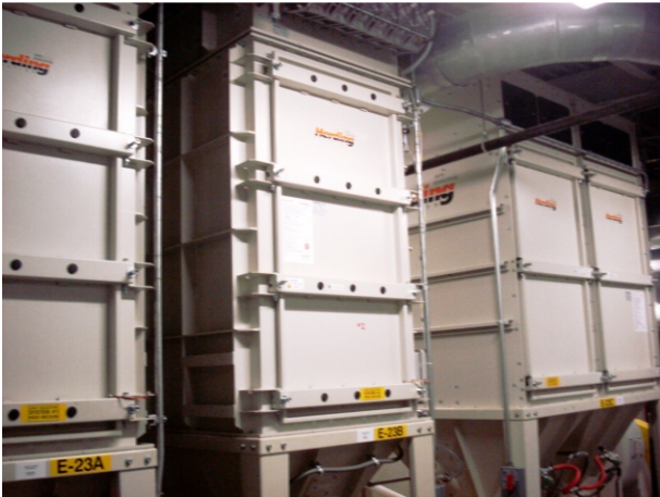
Pict.1: Herding® Filter Units