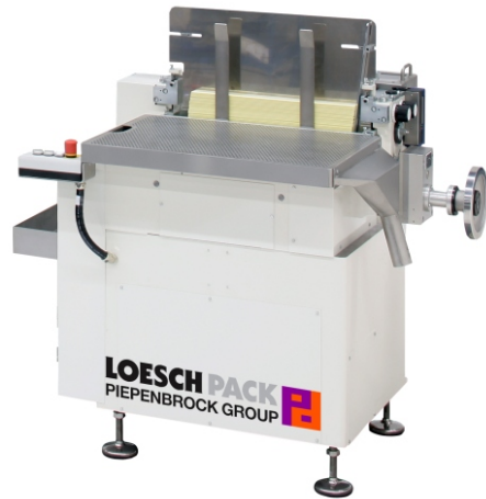
Pict. 2: Packing machine